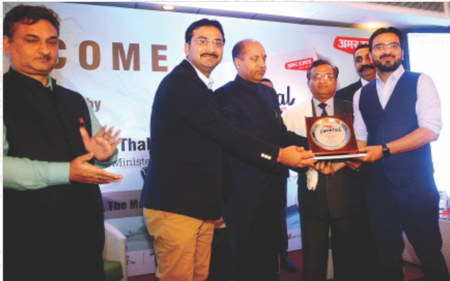
Amar Ujala Himachal Achiever Award

A matter of great pride that once again Career Academy Senior Secondary School excelled in the field of education. On November 2nd, 2018 The Tribune group of newspapers and Chandigarh University honoured Representatives / Owners/ Principals of 50 schools of HP in different categories. On the basis of Collection of data and results Career Academy bagged "Academic Excellence Award" This award has been bestowed to only 5 best schools of the State. The school achieved the "Best Sr. Sec. School in Himachal Pradesh" by "Praxis Media National Quality Excellence Award 2019.