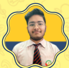
ANSH IIT ROORKEE