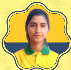
AVANTIKA IGMC SHIMLA