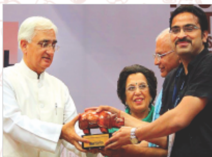
STEM Education "Best 2nd School in India" presented by Honourable External Affairs Minister Salman Khurshid in 2013