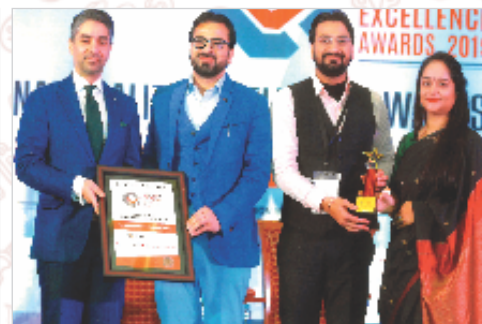
Praxis Media "Best School of Himachal Pradesh" presented by Olympic Gold Medalist Abhinav Bindra in 2019