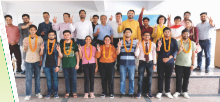
Celebrating Victory after Cracking Neet & Jee Advance Exam