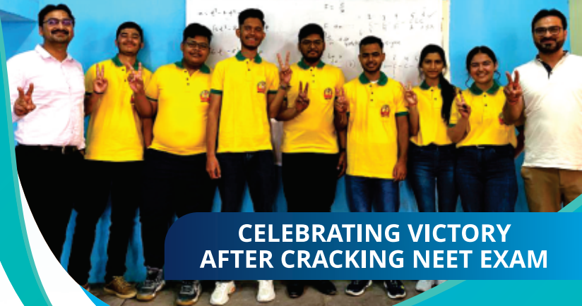
CELEBRATING VICTORY AFTER CRACKING NEET EXAM

The school got 254 Merit Certificates in 2020-21 from H.P Board.