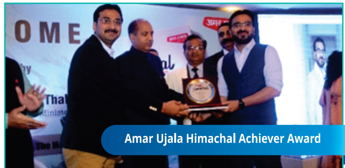
Amar Ujala Himachal Achiever Award