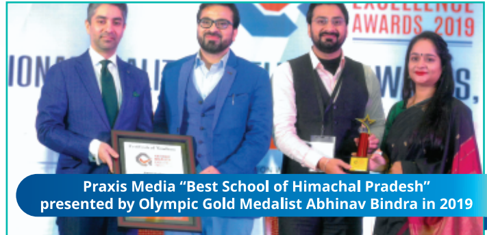
Praxis Media "Best School of Himachal Pradesh" presented by Olympic Gold Medalist Abhinav Bindra in 2019