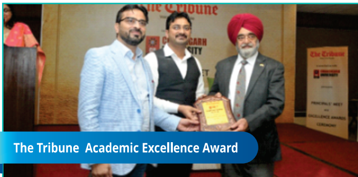
The Tribune Academic Excellence Award