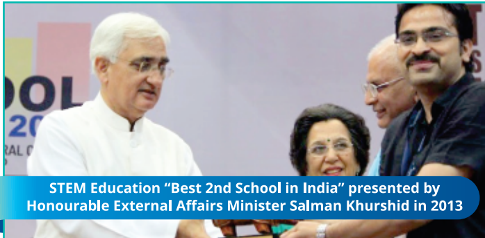
STEM Education "Best 2nd School in India" presented by Honourable External Affairs Minister Salman Khurshid in 2013

It is a matter of great pride that once again Career Academy Senior Secondary School excelled in the field of education. On November 2nd, 2018 The Tribune group of newspapers and Chandigarh University honoured Representatives/ Owners/Principals of 50 schools of HP in different categories. On the basis of Collection of data and results Career Academy bagged "Academic Excellence Award" This award has been bestowed to only 5 best schools of the State. The school achieved the "Best Sr. Sec. School in Himachal Pradesh" by "Praxis Media National Quality Excellence Award 2019.